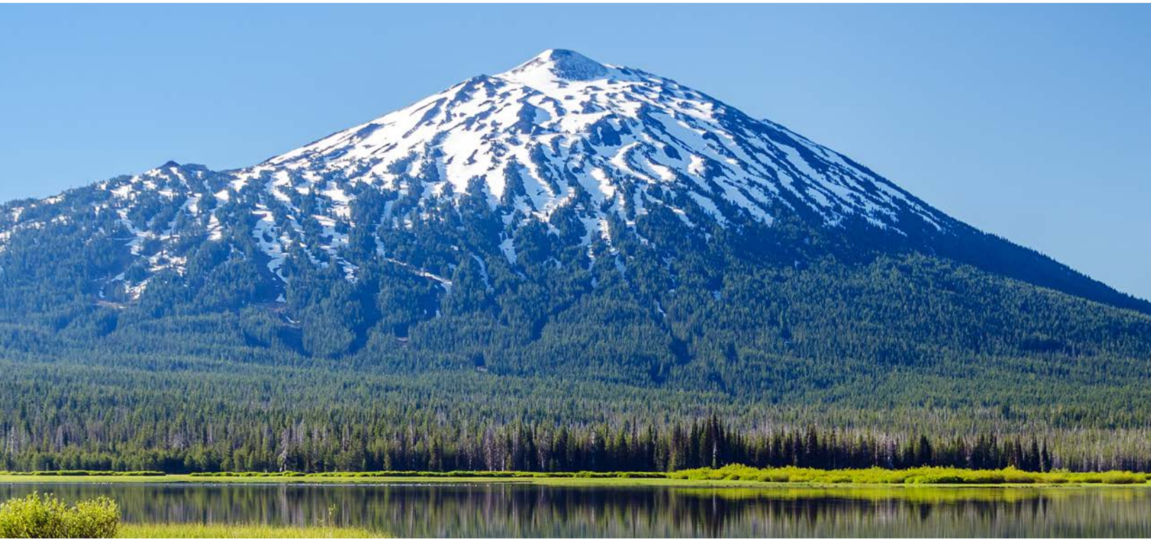
EXHIBIT & SPONSORSHIP OPPORTUNITIES

THURSDAY, JUNE 16 - SATURDAY, JUNE 18 | SUNRIVER RESORT - SUNRIVER, OREGON